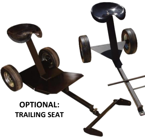
OPTIONAL: TRAILING SEAT

NOTE: Specifications may vary according to the types, and are subject to change without notice.