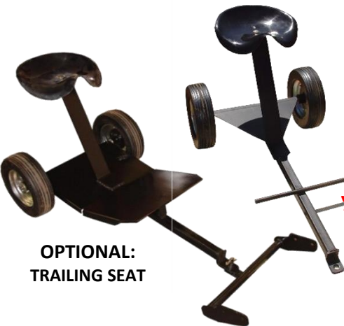
OPTIONAL: TRAILING SEAT

For your KUDU Rotary Lawnmower, you could choose the following options: