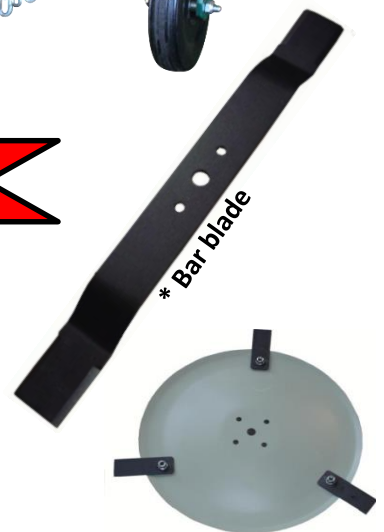
* Bar blade

NOTE: Specifications may vary according to the types, and are subject to change without notice.