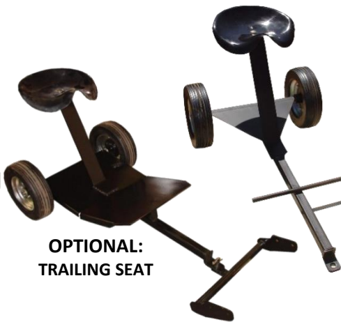
OPTIONAL: TRAILING SEAT

For your KUDU Rotary Lawnmower, you could choose the following options: