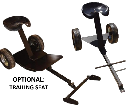
OPTIONAL: TRAILING SEAT