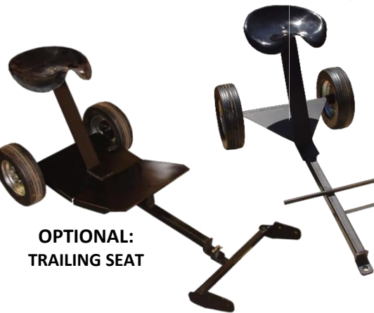
OPTIONAL: TRAILING SEAT

NOTE: Specifications may vary according to the types, and are subject to change without notice.