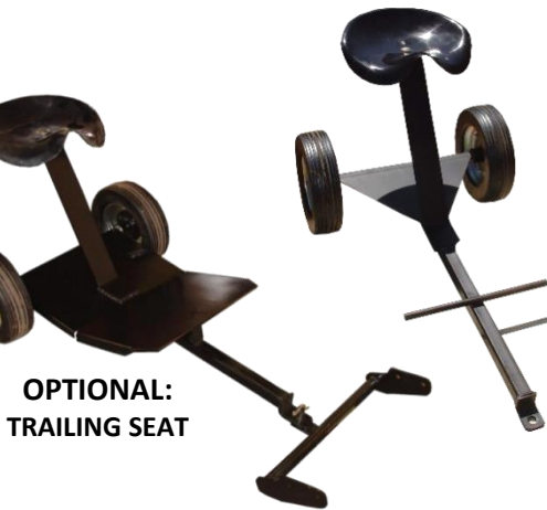
OPTIONAL: TRAILING SEAT

NOTE: Specifications may vary according to the types, and are subject to change without notice.