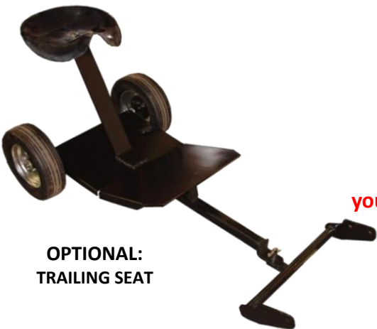
OPTIONAL: TRAILING SEAT