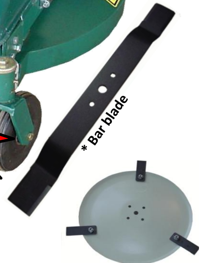
* Bar blade