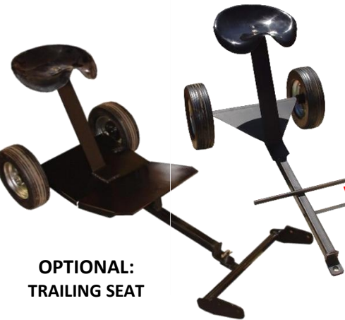
OPTIONAL: TRAILING SEAT