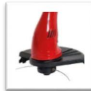
TRIM & EDGE