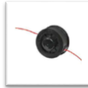
DUAL LINE SYSTEM ON ALL MODELS