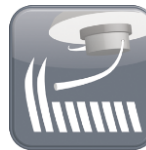
TRIM & EDGE