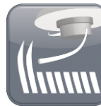
TRIM & EDGE