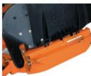
Operator Controlled Discharge Chute

Operator Controlled Discharge Chute allows you to quickly and easily block off the discharge chute while mowing.