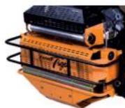
Turf Tiger Bumper

Protect the rear of your Turf Tiger from damage. *NOTE: can not be used with grass collection systems.