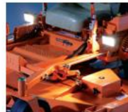
Halogen Light Kits

Two super bright halogen lights deliver 38 watts each for a total of 76 watts of lighting power. All required wiring and brackets included.