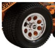
Chrome Wheel Covers

12" chrome wheel covers will add 2MPH to your Scag mower....ok, maybe not. But they look awesome!